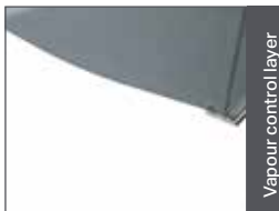
Vapour control layer

BBA approved technology forms a super-strong i-beam structure and insulates the roof.